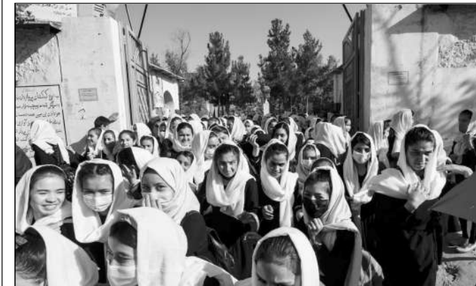
KABUL — Deep in the corner walls of a school in Kabul...