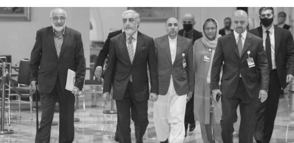
Members of the Peace Mediation Team (PMT) in Kabul, Afghanistan, August 10, 2021.

As the Afghan government and the Taliban continue to struggle over who will control Kabul, they ignore the fact that they will not win any legitimacy unless the Afghan people agree to them. The Afghan people are the sole sovereign over the country and as such, the power is in their hands. The current Afghan administration and the Taliban should remember that unlike in the Middle Ages, today holding political power does not mean being crated but rather being a servant to the people. When it comes to all matters of the country, including war and peace, governance, reconstruction, the country will continue to suffer from economic underdevelopment, dysfunctional political infrastructure, bureaucratic inefficiency, and rampant corruption.