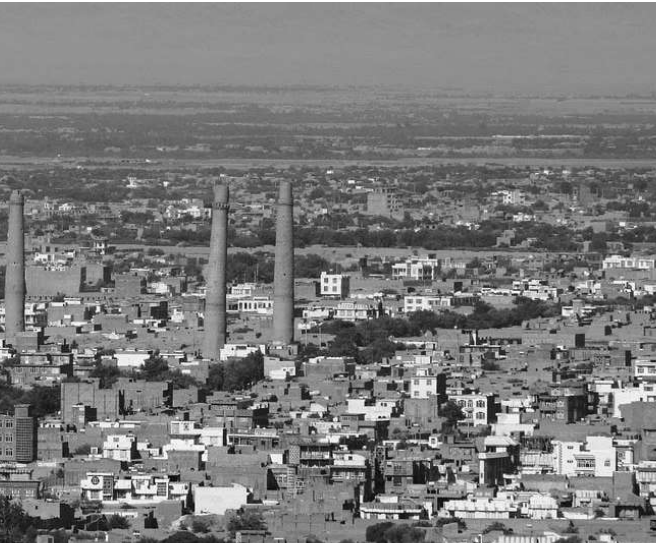
Herat city skyline