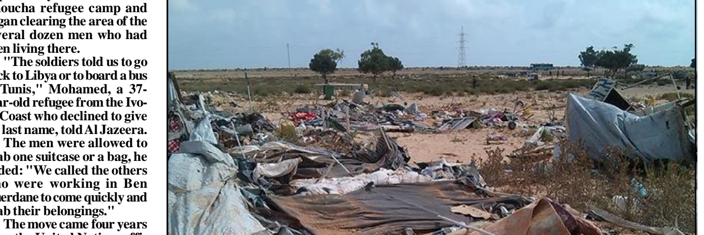
The statement calls on the UN refugee agency to reassess the way the camp was run and to provide the necessary assistance to the people in the camp.

One morning last month, a group of refugees in Tunisia's Choucha desert camp were alerted to get up and begin clearing the area of the camp. They were told to pack their belongings and to be ready to leave by the next day. The camp was closed by the Tunisian government, and the refugees were left in a state of limbo. The camp was closed because of the risk of a terrorist attack. The Tunisian government had received information from a source that a group of militants was planning an attack on the camp. The camp was closed for several days, and the refugees were left in a state of limbo. — Press TV