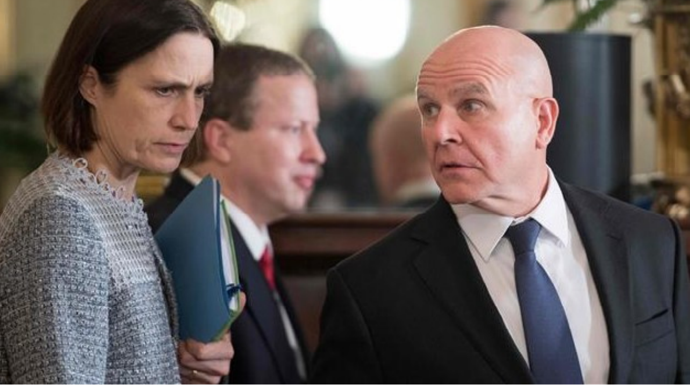
US National Security Advisor H.R. McMaster is seen in Istanbul, Turkey, on Tuesday. He is seen with Turkish President Recep Tayyip Erdogan. McMaster is seen with Erdogan in Istanbul, Turkey, on Tuesday. He is seen with Erdogan in Istanbul, Turkey, on Tuesday.