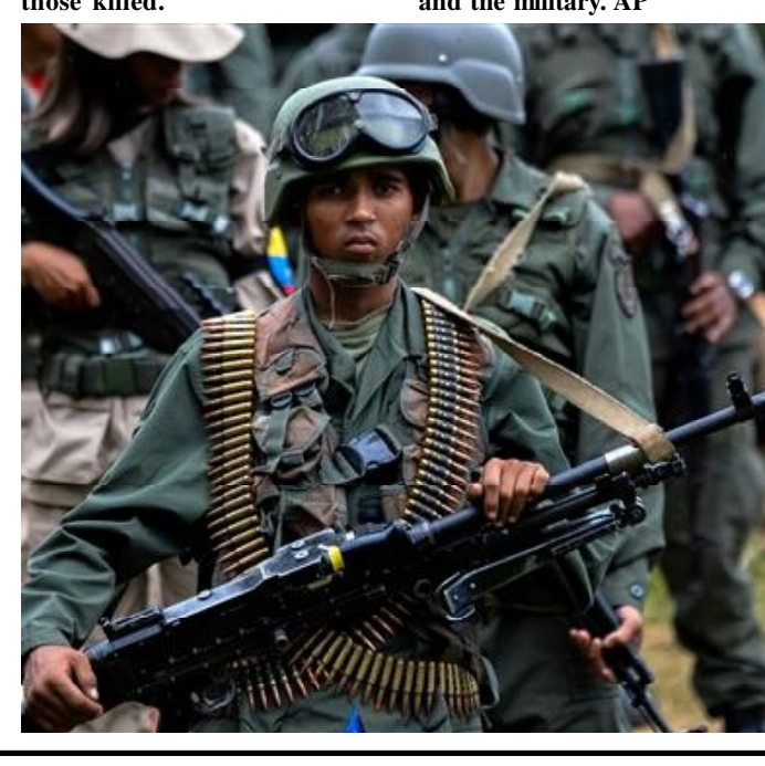
A soldier in military uniform is seen in a field setting. The soldier is wearing a helmet and holding a rifle. The soldier is seen in a field setting. The soldier is wearing a helmet and holding a rifle.

The United States and other friends of the United States have made humanitarian assistance to the people of Afghanistan, according to a statement issued by the United States on Monday. The assistance includes food, medicine, and other supplies. The United States said that the assistance is being provided to help the people of Afghanistan cope with the challenges they are facing. The United States Times