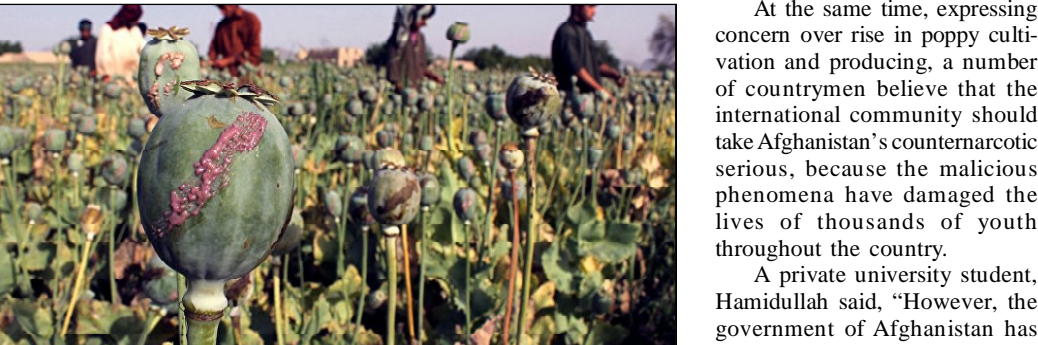
Officials said this is a good opportunity in which Kabul and Washington to reduce their cooperation in counternarcotics...

coordination between the government of Afghanistan and international community's cooperation in counternarcotics. At the same time, officials of Afghanistan's military for counternarcotics said, "The government of Afghanistan will surely be able to reach into the regional countries and its benefits cooperation."