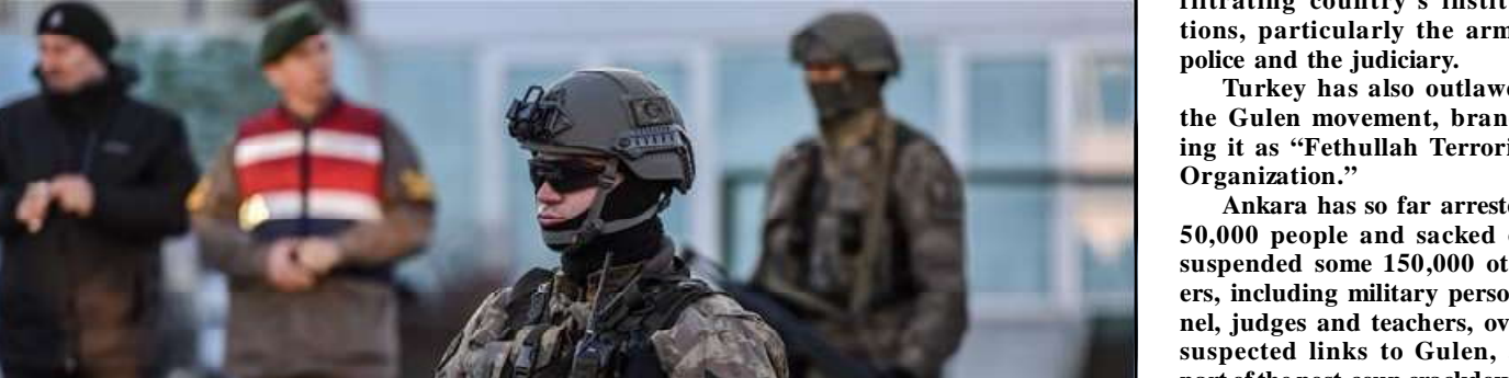
A soldier in military uniform.

Ankara has accused 85 members of parliament of orchestrating the abortive coup. Turkey's justice ministry has issued arrest warrants for 85 members of parliament in a long-running campaign to investigate the 2016 military coup. The warrants are part of a long-running campaign to investigate the 2016 military coup. The warrants are part of a long-running campaign to investigate the 2016 military coup.